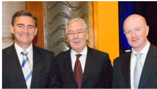
The Victorian Treasurer (now Premier), the Hon John Brumby with Central Bank Governors Mervyn King and Glenn Stevens at the Inaugural Distinguished Lecture.